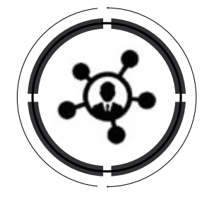
Project Management & Execution