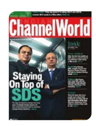
Channel World Magazine Cover Story